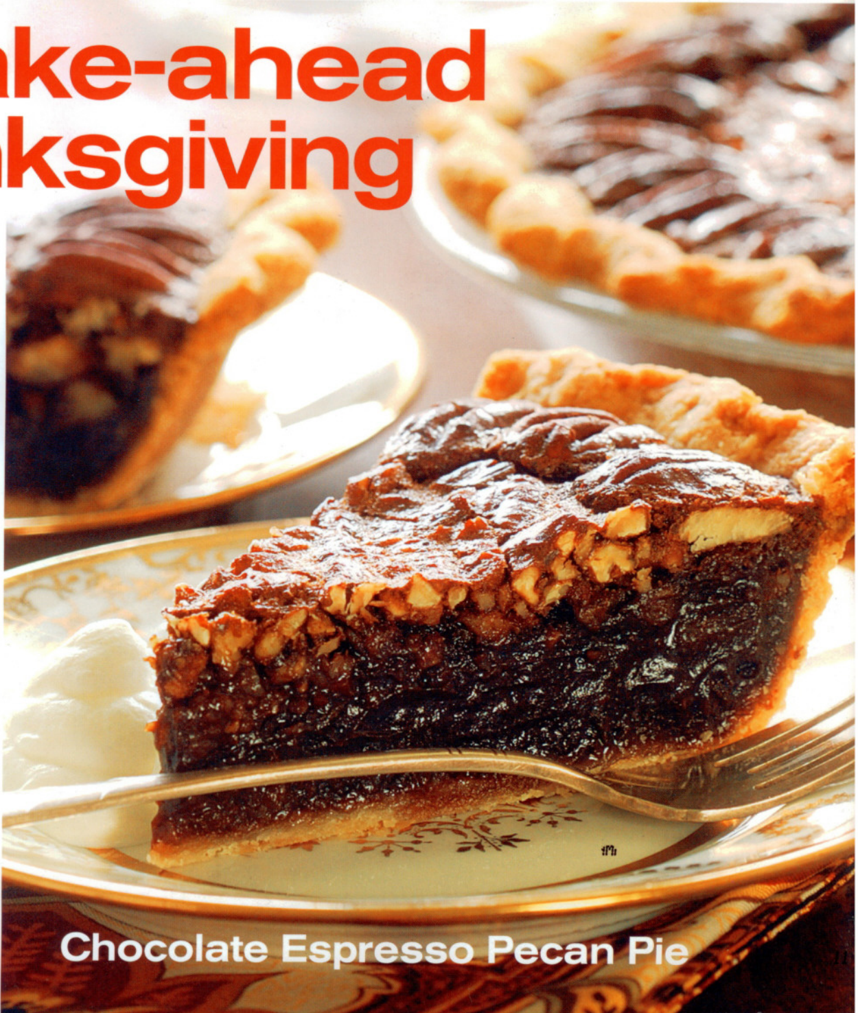
Chocolate Espresso Pecan Pie