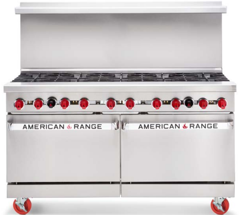
Model AR12G-8B Shown with optional stand & casters.

The Heavy Duty Restaurant Range Series by American Range was designed for continuous rugged use and performance. All the latest technology is incorporated to give you the best value for your money.