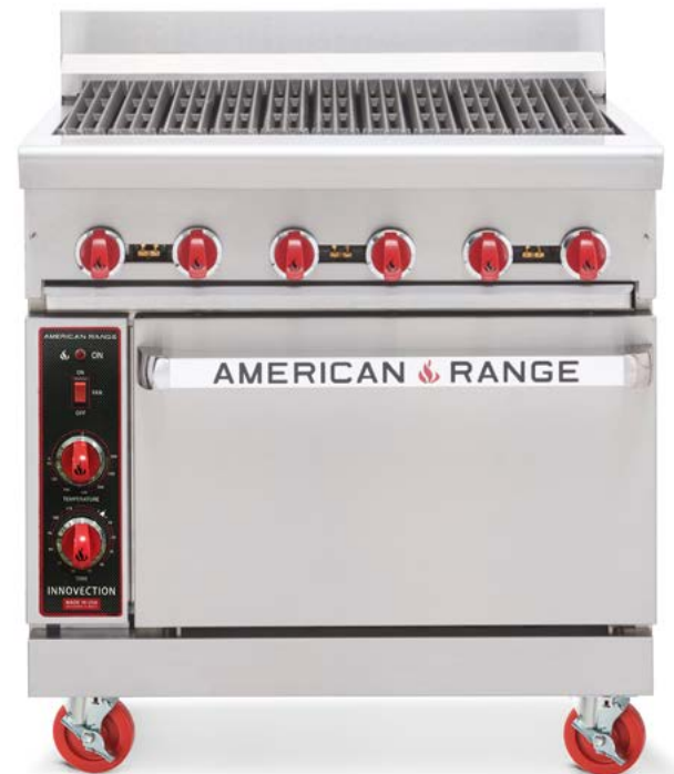
Model AR-4RB-CS Shown with optional Casters & Convection Oven with Storage Base

American Range Heavy Duty Restaurant Equipment is designed for continuous rugged use and performance. Incorporating all the latest technology, American Range commercial cooking equipment is constructed for durability, dependability and gives you the best value for your money.