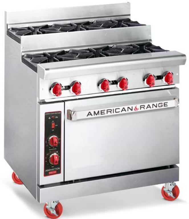
AR6-SU-C Shown with optional convection oven & casters

American Range ARSU step up ranges are Stainless Steel providing a rugged exterior body with a heavy gauge welded frame construction. They have a 6" deep front Stainless Steel bullnose landing ledge/workspace in front and a 6" high Stainless Steel stub back instead of a high riser. High temperature knobs are built for comfort and stability. Range stands on 6" highly polished chrome adjustable steel legs.