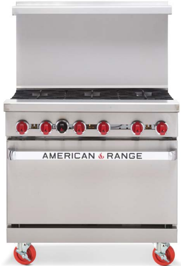
Model ARW36-6 Shown with optional oven and casters.

The Heavy Duty Restaurant Range Series by American Range was designed for continuous rugged use and performance. All the latest technology is incorporated to give you the best value for your money.