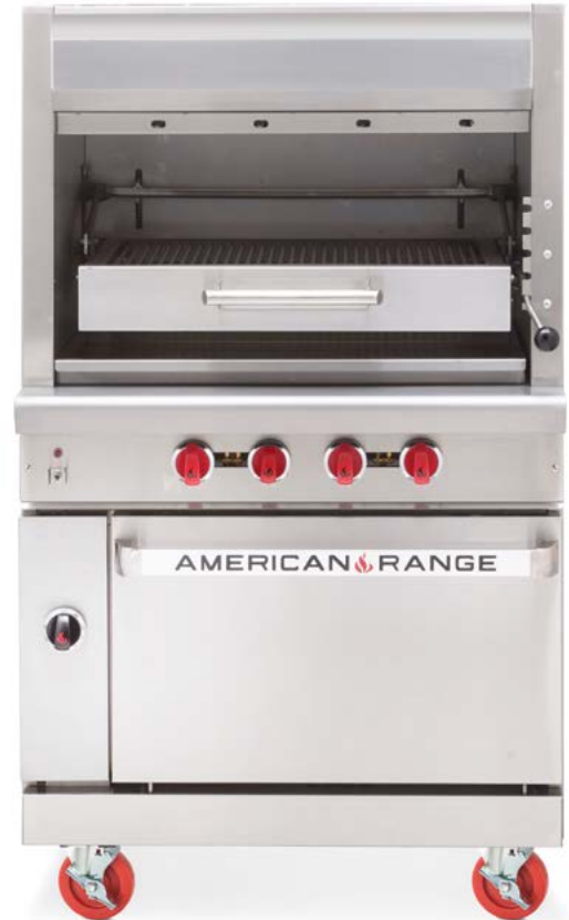
Model AGBU-3 Shown with optional Casters.

The American Range Double Deck Infrared Overfired Broiler has a reputation that lives up to its name. The AGBU-3 gas-fired powerhouse has four infrared burners that direct nearly 131,000 BTU/hr. of 1850° infrared heat downward to penetrate and sear the exposed surface of the meat, fish, vegetable or casserole products. Since the cooking is accomplished using only infrared heat, the food experiences minimal shrinkage and retains juices, tenderness and flavor.