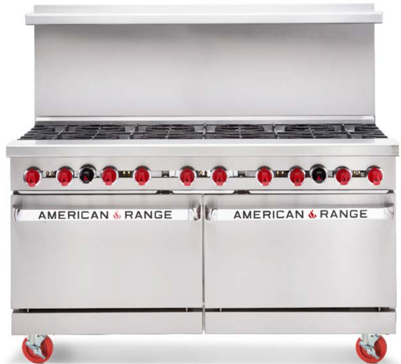
Model AR-10 Shown with optional stand & casters.

The Heavy Duty Restaurant Range Series by American Range was designed for continuous rugged use and performance. All the latest technology is incorporated to give you the best value for your money.