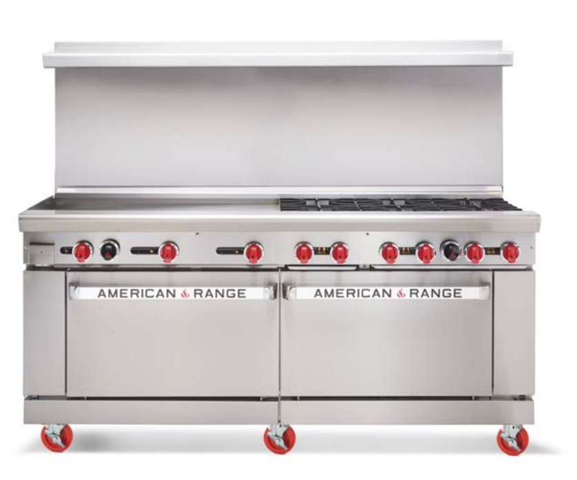
Model AR36G-6B Shown with optional casters.

The Heavy Duty Restaurant Range Series by American Range was designed for continuous rugged use and performance. All the latest technology is incorporated to give you the best value for your money.