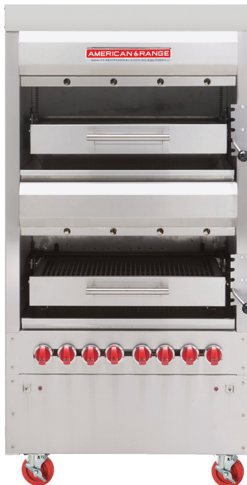
Model AGBU-2 (shown with optional casters)