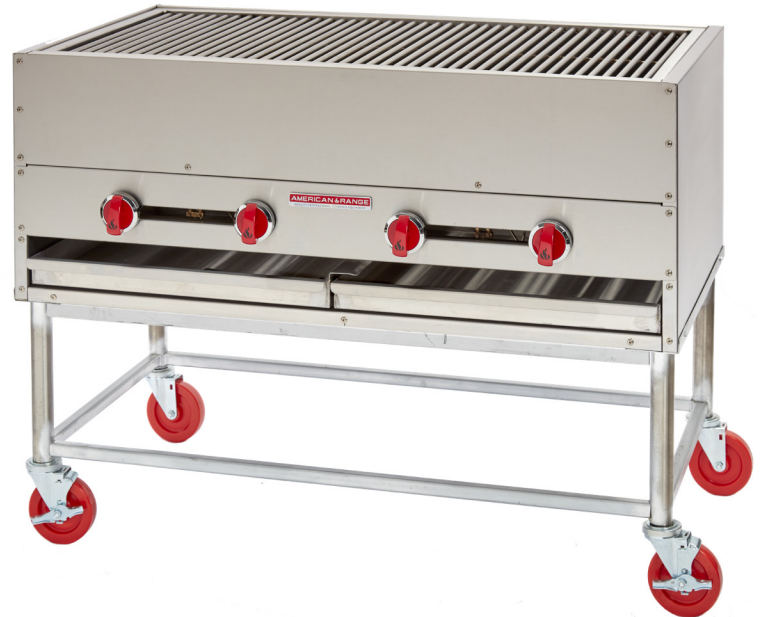
Model Shown AR-CCB-4836 Shown with optional casters