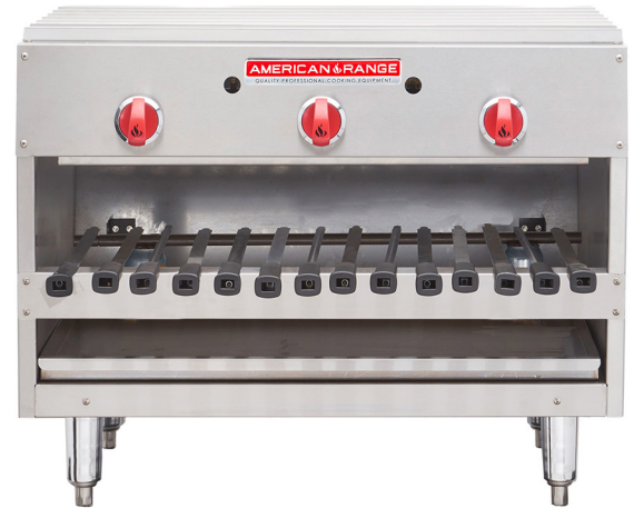
Model Shown AROB-36