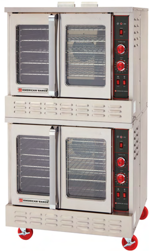
Model Shown MSD DBL (Standard depth)