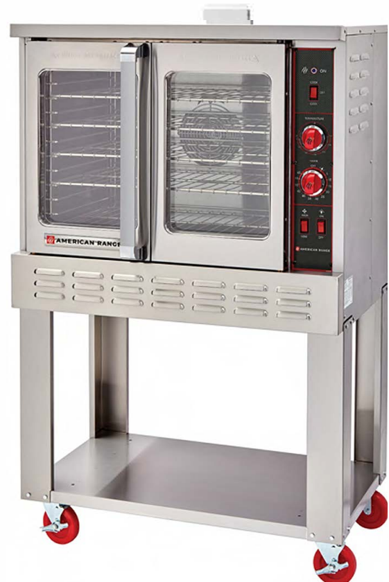
Model Shown MSDE-1 (Standard depth)