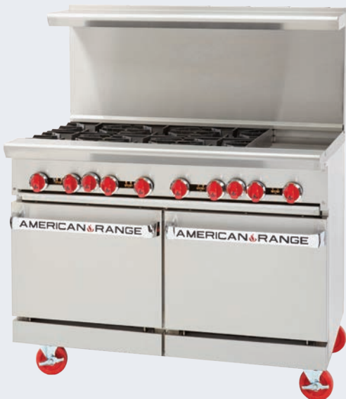
48" Range Space Saver Oven