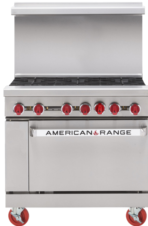
Model Shown ARGF-6