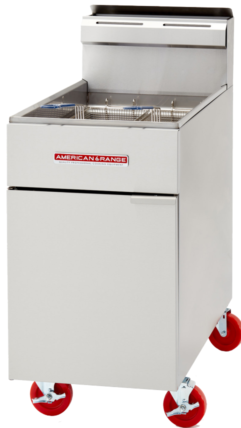
Model Shown AF-75 Shown with optional casters