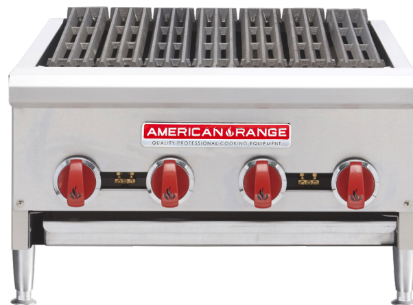
Model Shown ARRB-24