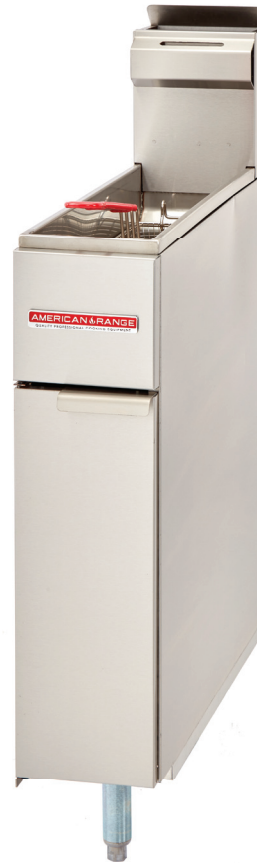
Model Shown AF-25*

*Unit comes with two legs; fryer must be anchored for stability.