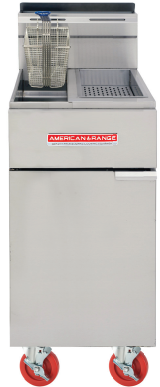
Model Shown AF25-DS