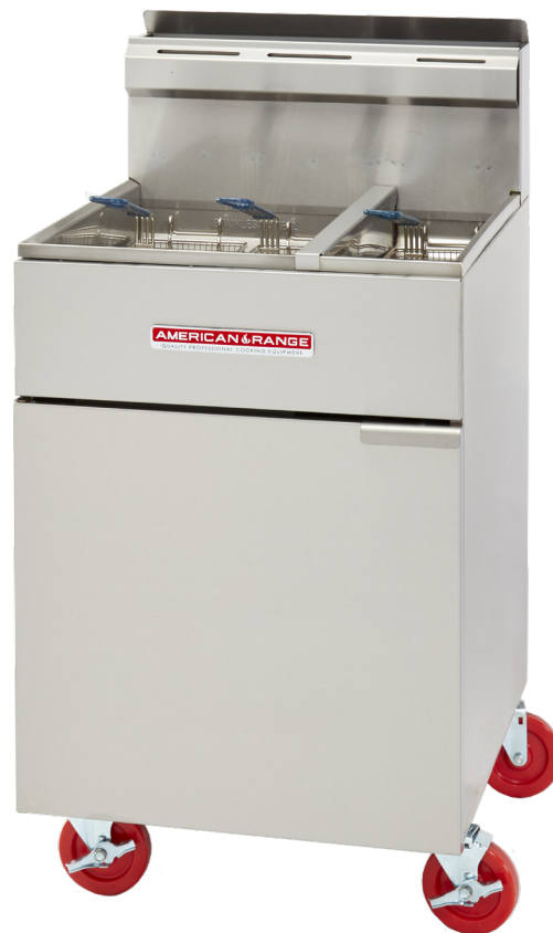
Model AF-50HE/25 Shown with optional casters