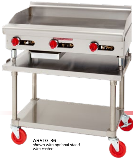
ARSTG-36 shown with optional stand with casters