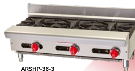
ARSHP-36-3 Single depth hot plate