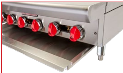
Stainless steel drip tray