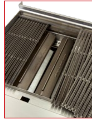
Charbroiler shown with cast iron radiants for better heat distribution.