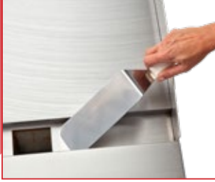
3" spatula width grease trough