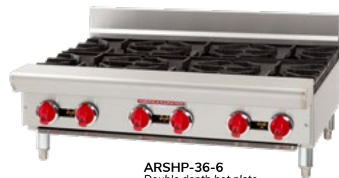
ARSHP-36-6 Double depth hot plate