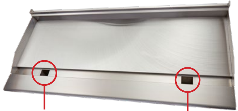
60" and 72" models come standard with two grease shoots and two grease drawers

Optional stands with legs or optional stands with casters available for all countertop units.