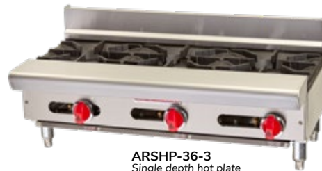
ARSHP-36-3 Single depth hot plate