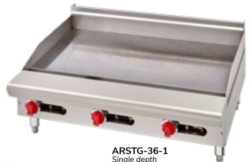
ARSTG-36-1 Single depth thermostatic griddle