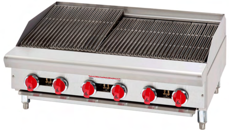
Model Shown ARSRB-36