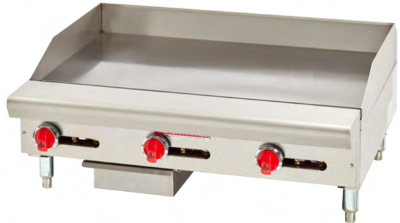
Model Shown ARSTG-36