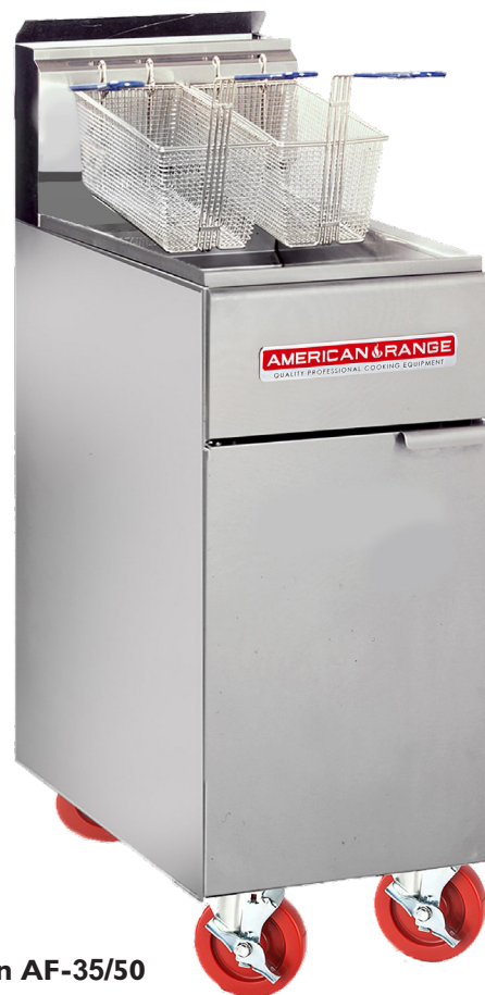
Model Shown AF-35/50