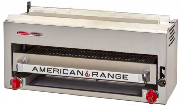
Model Shown ARSB-36