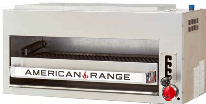
Model Shown ARSM-36